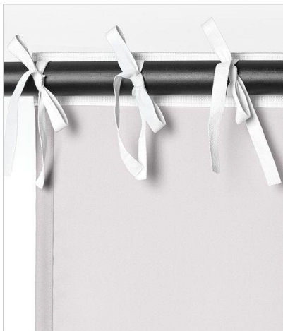
Drape tied to the pipe

NOTE: Rigging to ceiling support required. Structural weight limits required from the venue and authorization of this system